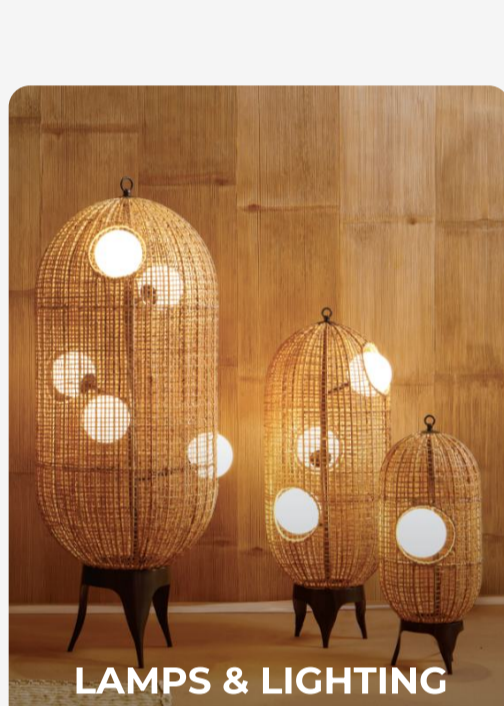
LAMPS & LIGHTING