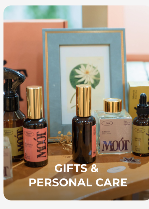
GIFTS & PERSONAL CARE