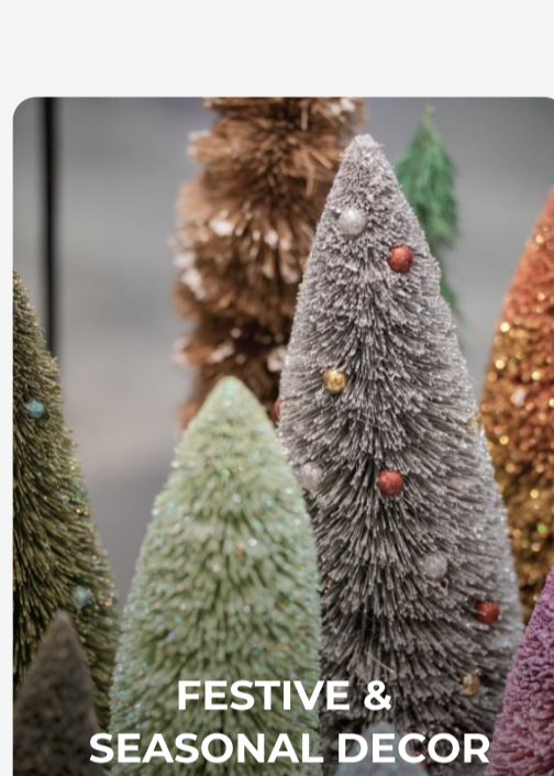
FESTIVE & SEASONAL DECOR