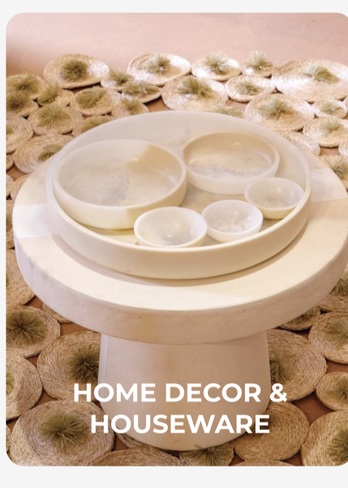
HOME DECOR & HOUSEWARE