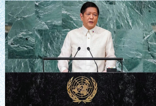
President Ferdinand R. Marcos, Jr. at the General Debate of the 77th United Nations General Assembly (New York, September 2022)

“My country’s experience in building peace and forging new paths of cooperation can enrich the work of the Security Council. And to this end I appeal for the valuable support of all United Nations Member States for the Philippines’ candidature to the Security Council for the term of 2027 to 2028.”