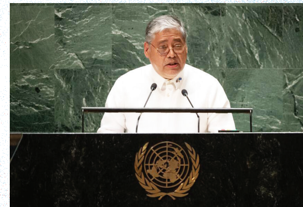
Secretary for Foreign Affairs Enrique A. Manalo at the General Debate of the 78th United Nations General Assembly (New York, September 2023)

“My country’s experience in building peace and forging new paths of cooperation can enrich the work of the Security Council. And to this end I appeal for the valuable support of all United Nations Member States for the Philippines’ candidature to the Security Council for the term of 2027 to 2028.”